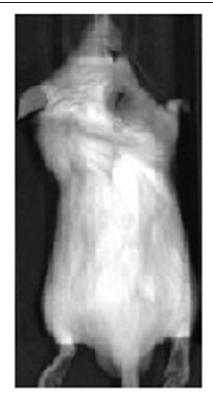
control: plasmid alone

As EPCs can carry large nucleic acid strands, they may be useful for gene therapy of rare diseases. NEU-WAYs current development focuses on lysosomal storage diseases, like metachromatic leucodystrophy. For this and other rare diseases, NEUWAY plans to run its own clinical development programs. NEUWAY is also open to partner its CNS drug delivery platform with