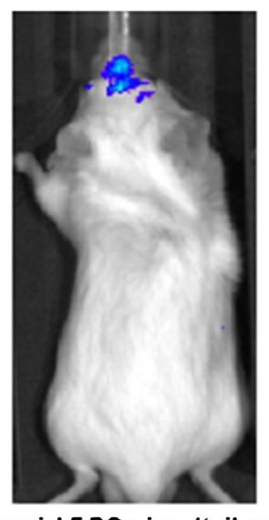
plasmid-EPCs i.c. plasmid-EPCs i.v. (tail vein)